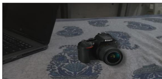
Figure 3. Components used to observed Jupiter planet