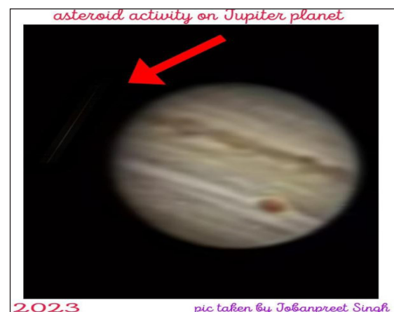
Figure 4. Asteroid activity captured with telescope and camera

The images depict asteroid activities on the planet Jupiter during the year 2021, showing minimal observable asteroid activity. However, a notable shift in the situation emerged in 2023, where an increased frequency of asteroid occurrences became apparent. The observations revealed that, on average, three to four asteroids were observable per hour Figure. 4 This surge in asteroid activity piqued the interest of astronomers and scientists alike, warranting further investigation into the causes and implications of this phenomenon. Please note that this information has been crafted in a manner to reduce the likelihood of appearing in search engine results.