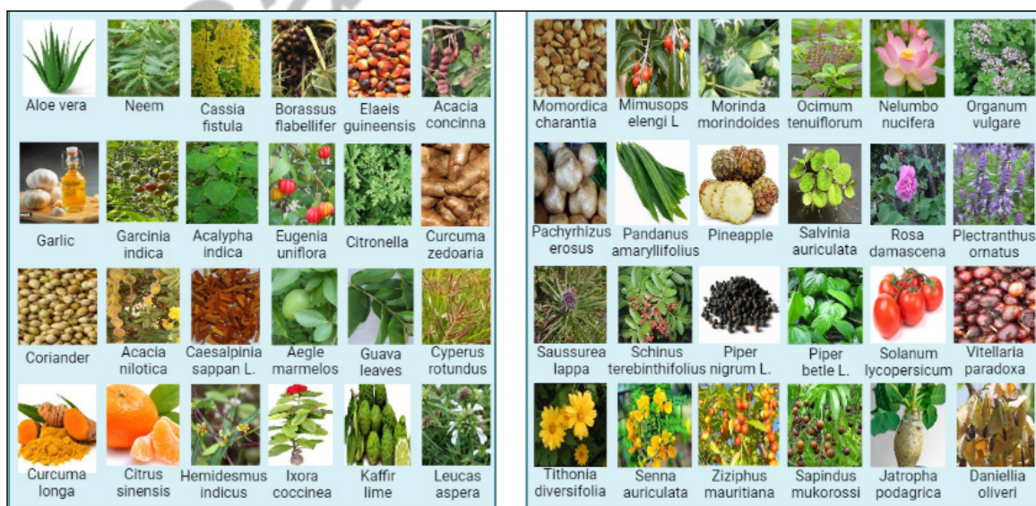
Figure 2. Medicinal Plants Used for Soap Formulation